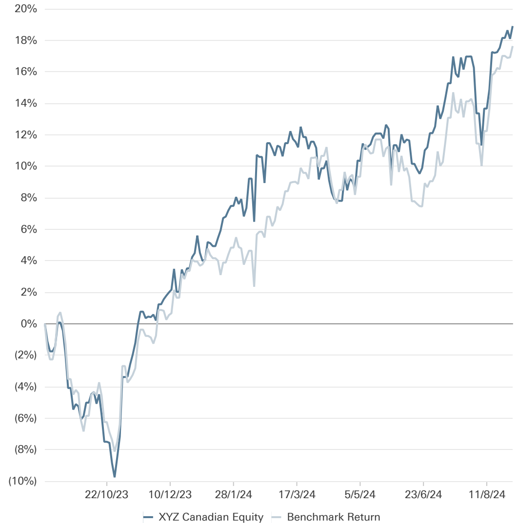
XYZ Canadian Equity Return Vs Benchmark Return - 1 Year

*The ESG (Environmental, Social, and Governance) score is rated on a scale of 1 to 5