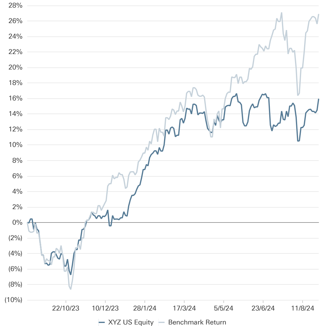
XYZ US Equity Return Vs Benchmark Return - 1 Year

*The ESG (Environmental, Social, and Governance) score is rated on a scale of 1 to 5